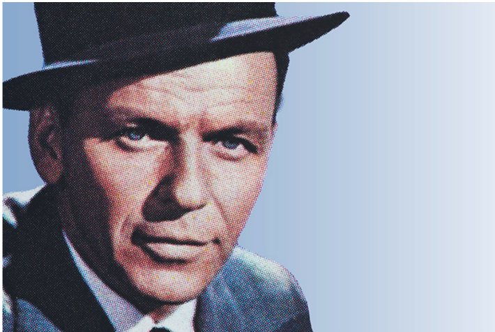
Two different Southwest Florida theaters paying tribute to Ol' Blue Eyes

BY NANCY STETSON nstetson@floridaweekly.com