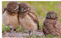
Learn how to protect our feathered friends